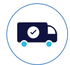
Fleet Management & Driver Performance